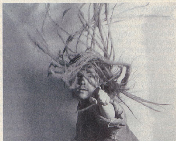
Bass and Trouble